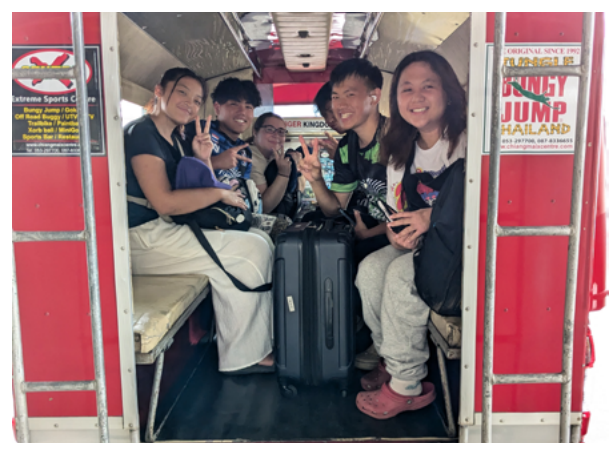
Instead of hiring a private driver, team members decide to ride a local taxi to the airport, saving money and getting a true cultural experience.